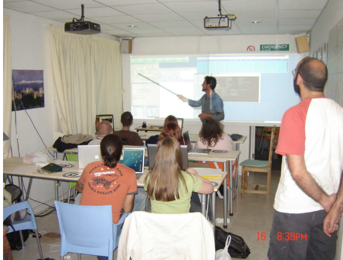
Figure 1: The “classroom” in the service building showing the tables and the projection screen

comfortably seat 3 persons each, and in front of this we have a large projection screen ( \sim 1.5\text{m} \times 3\text{m} ). During the night this screen is used to project a live copy of the display of the data acquisition computer being operated in the telescope control room.